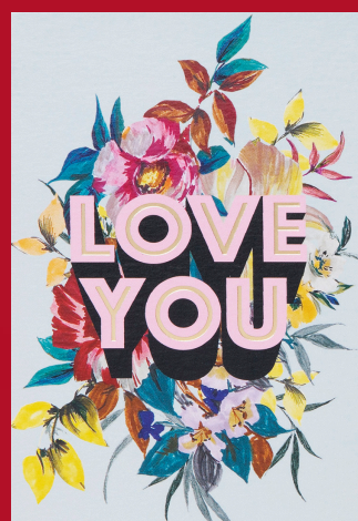
MMDF1949 Love you