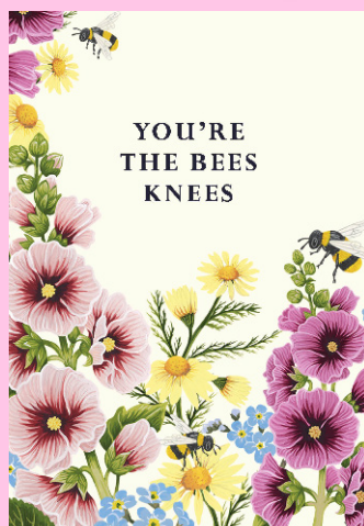
CDS2143 Bees knees