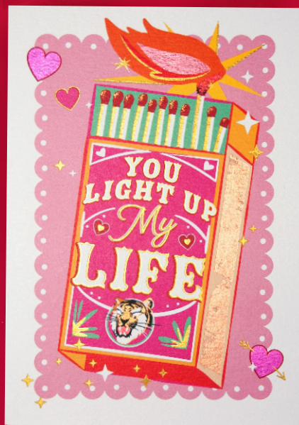
HF2158 Light up