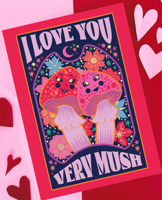
LFP2311 I love you very mush