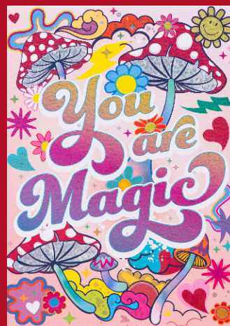
HF2318 You are magic