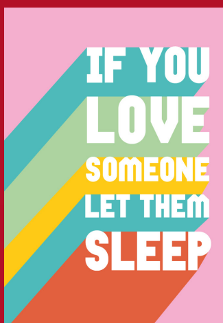
FLF1777 Let them sleep